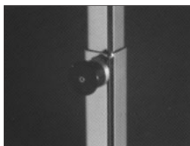
SELF-LOCKING EXTENSION TUBE An easy operating height adjuster and a screen case lock.