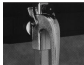
SCREEN FABRIC TENSION LEVER Locking the screen fabric rigidly in place during usage, the screen fabric tension lever prevents the surface from shifting, ensuring long product life.