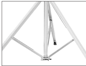
EXTRUDED ALUMINUM LEGS WITH TOE RELEASE Heavy-gauge tripod legs lock securely for transport and release at the touch of a toe.