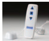
For optional remote control operation, see options on pages 50-54.